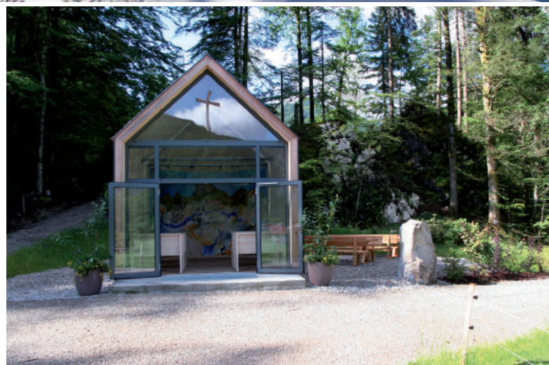
The Joseph-Mohr-Chapel in Hintersee

The Joseph Mohr Memorial Walk is a circuit route through the town centre (about 1.2 km). Along the way, stories and