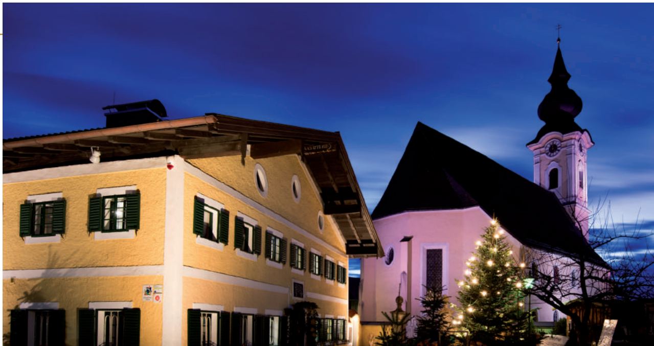
The Silent Night District Arnsdorf with the schoolhouse and the Pilgrimage Church, which was consecrated in 1520.

consists of 36 human figures and 16 wooden animal figures dressed in clothes. The baby Jesus is made entirely of wax, as is the head of the figure of Mary. The clothing reflects different social stratifications and the traditional costumes (Tracht) in the regions surrounding Arnsdorf and Lamprechtshausen. The shepherds and the Holy Family groups were displayed in the church during Advent or Christmas Eve, the three Magi and their entourage were added on January 6.