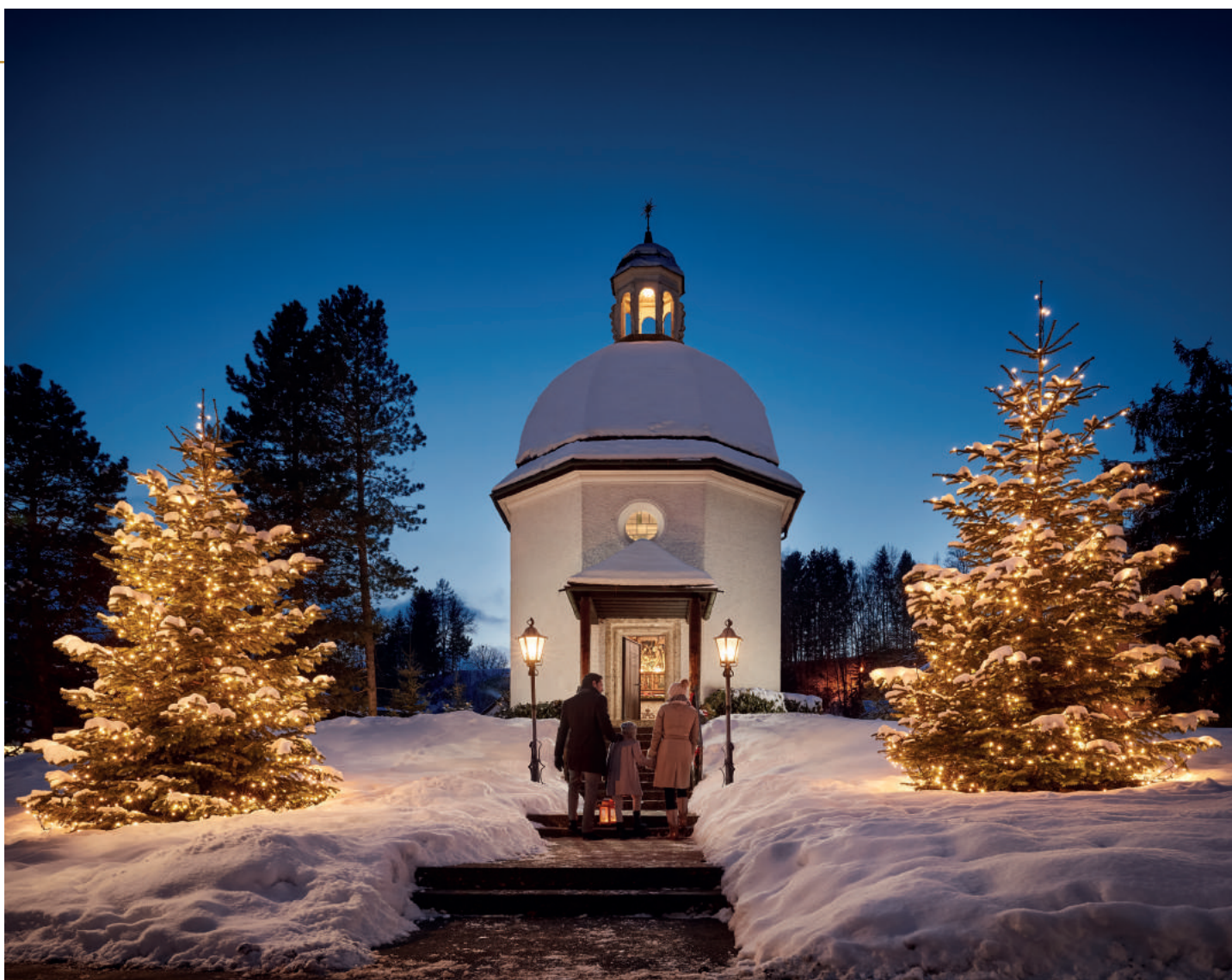
The Silent Night chapel by night.

connecting Laufen and Oberndorf is still an impressive testimonial to the typical steel architecture of the late 19th century. It was intended as a flood-proof replacement for the wooden bridge, which lead from the western side of the Laufen spit to Altach and withstood the flood disaster of 1920. The necessary opening on the Laufen side with the former closed groups of houses in the city and Marienplatz, could not take place today due to monument protection.