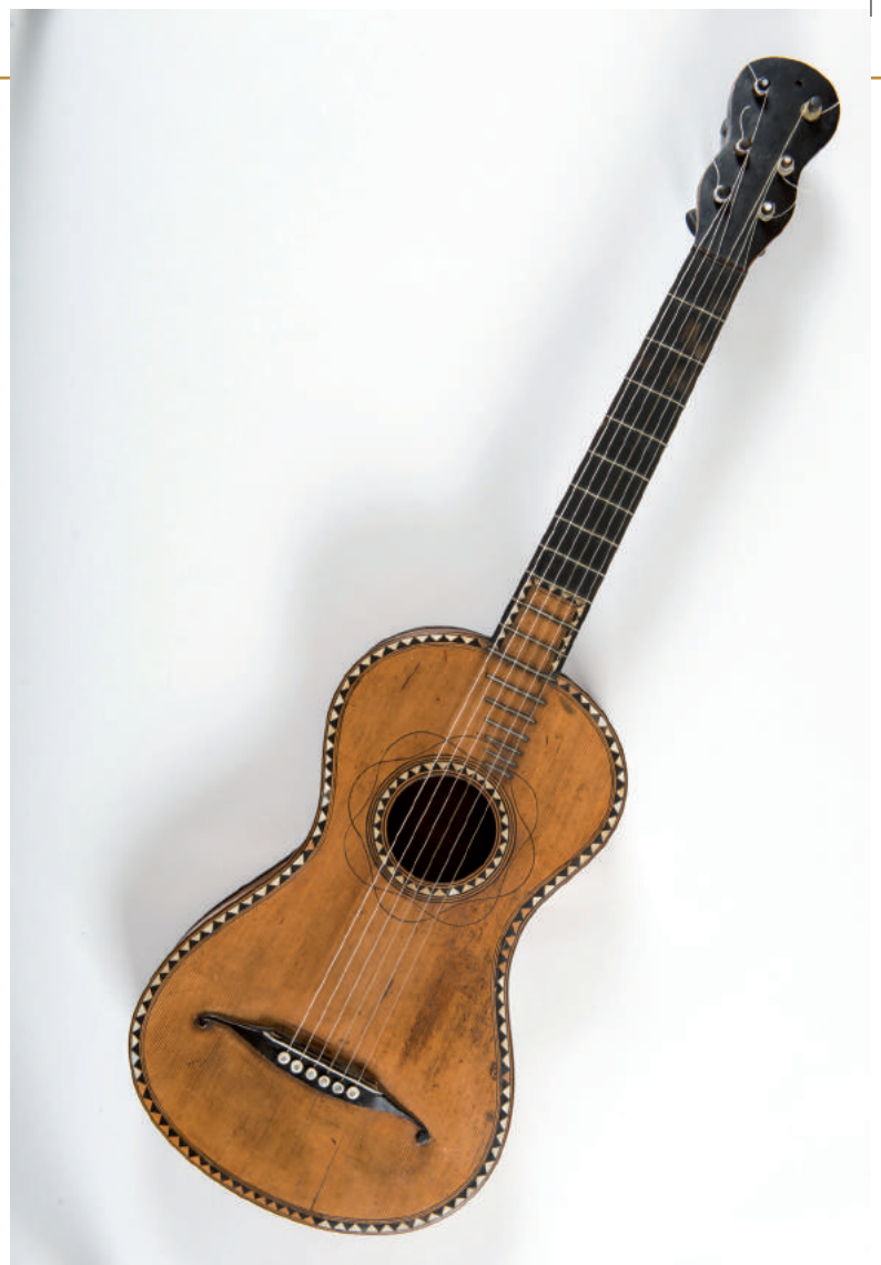
The "Silent Night" guitar, made around 1800 (©Keltenmuseum Hallein, Stille Nacht Museum).

Since 1993, a museum has been housed in the Franz Xaver Gruber's former residence and workplace. The museum will be redesigned in 2017/18 in keeping with the motto: "Meeting