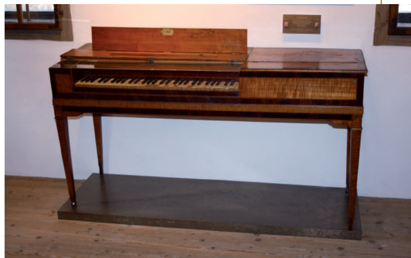
The fortepiano in the Gruber Memorial House in Hochburg-Ach, on loan from Burghausen.