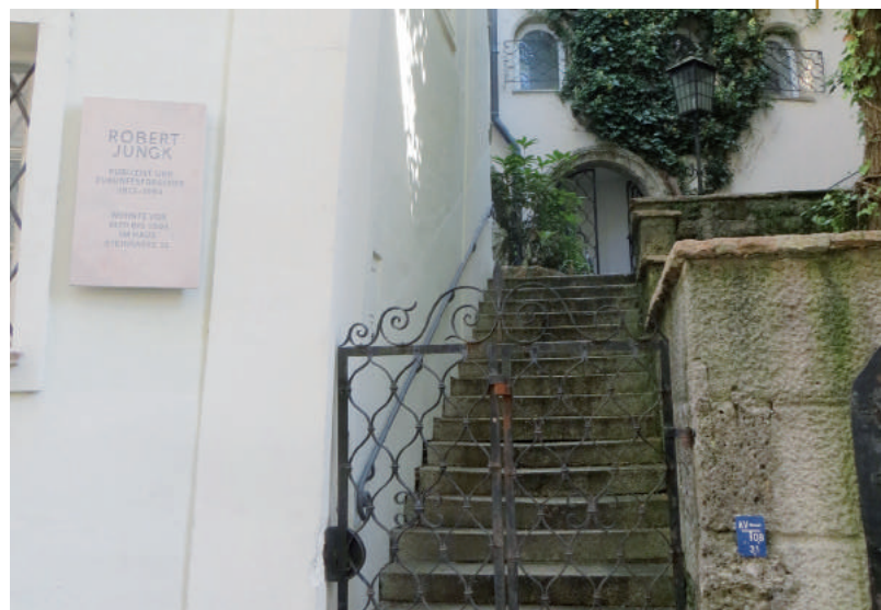
Joseph Mohr lived in the house on Steingasse 31 in 1794.

and classical dramas. In 1782, Prince Archbishop Hieronymus Count Colloredo banned performances in the University Theatre due to cutbacks.