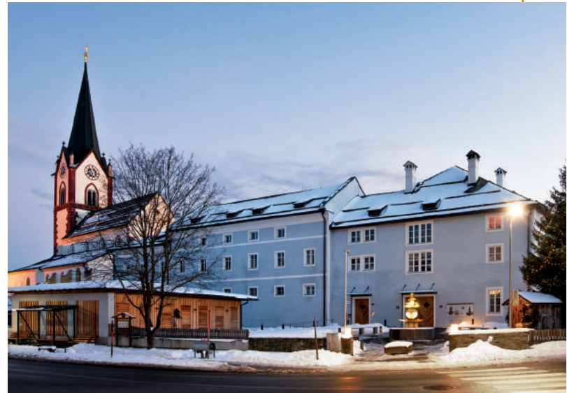
Church and Presbytery of Mariapfarr.

The museum is housed in the northern wing of the presbytery and consists of several rooms. In the first room is a large nativity scene set which is displayed as it would have been during Mohr's days; some of the figures are in the baroque style. It