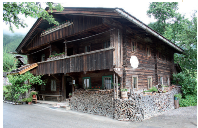
Exterior Appearance of the Strassers' House "Strasserhäusl".

Today the "Strasserhäusl" in Laimach, the home of the singer family, is a museum of local history and, of course, primarily records the history of the Strasser family. It is run by Rosi Kraft, enthusiastically curated, and is an insider's tip within the Silent Night Museums in the Silent Night region.