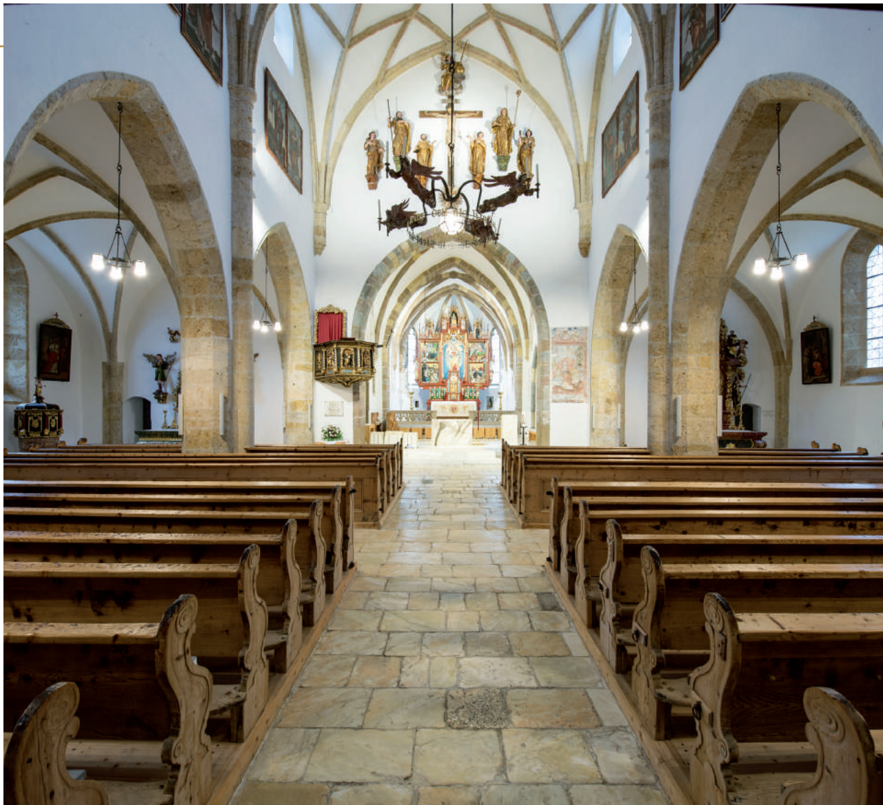
The Interior of the Parish and Pilgrimage Church with the High Altar: on the bottom of the left wing, the "Adoration of the Magi" dating back to around 1500 with the curly haired baby Jesus.

with gold frames displayed in a cabinet. Two oil paintings and a photo of the Schargler-keusche farmhouse hang on the wall.