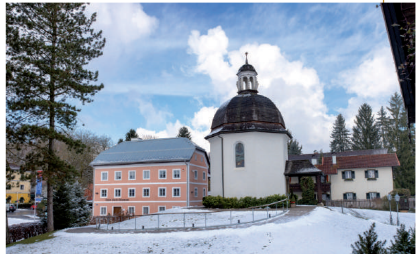
The Silent Night Chapel was consecrated in 1937 and is the focus of the Silent-Night-Movement.