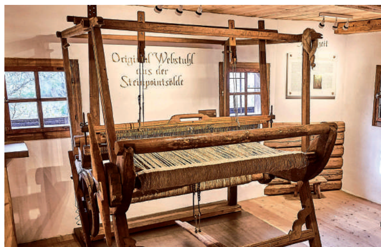
The F. X. Gruber Memorial House was redesigned in 2017. Here one can also see the loom on which Gruber learnt the weaving craft.

Since 2012, a peace walk beginning and ending at the Memorial House offers a relaxing one-hour circuit route to get in touch with the place where Gruber grew up. Five three-