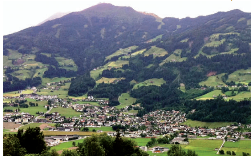
View of Fügen – the largest municipality in the Zillertal valley belongs to the Schwaz district in Tyrol.