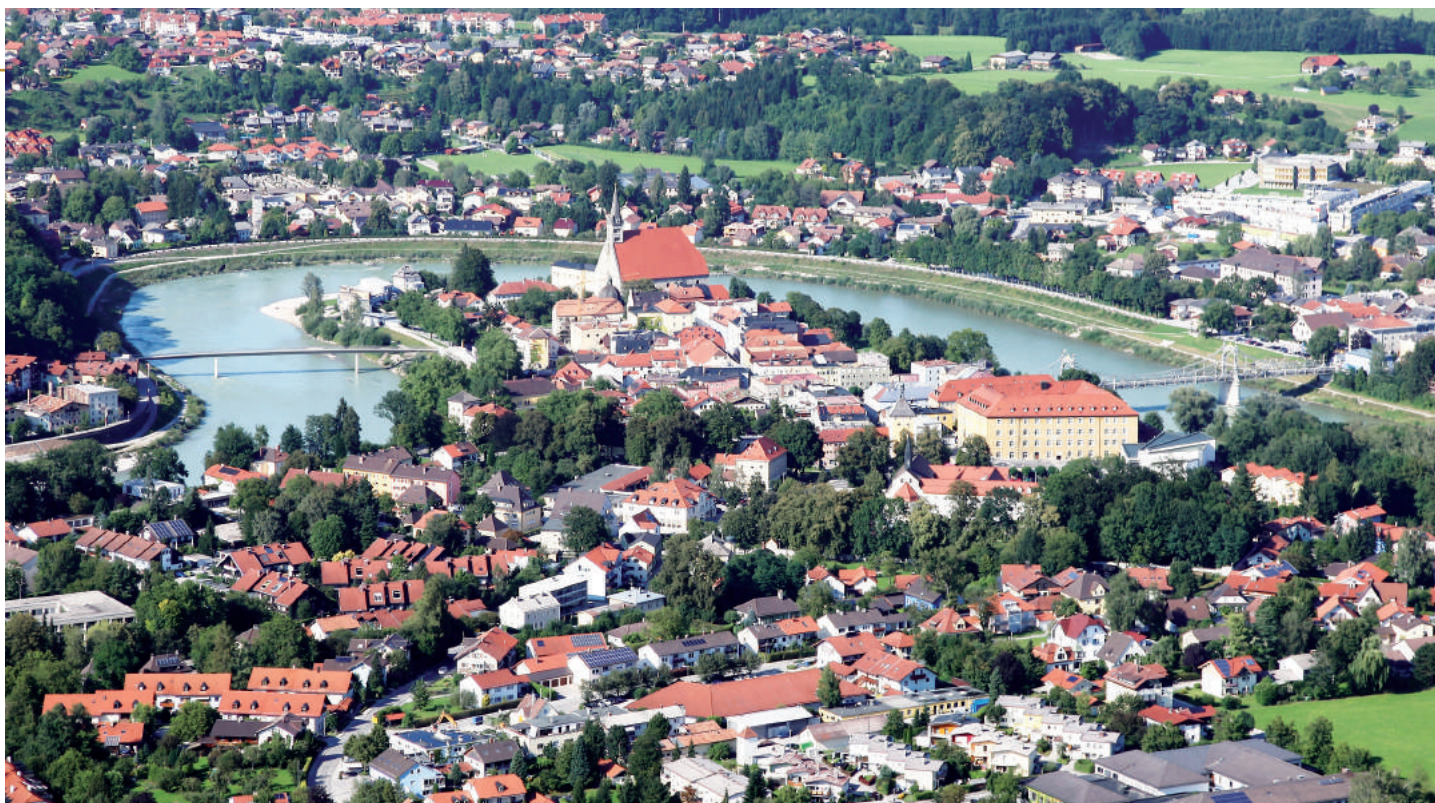
A view of Laufen: in the middle the collegiate church, behind it to the left on the Oberndorf side is the Silent-Night District with the water tower dating back to 1540.

boatmen community. Even before 1660, a wooden chapel stood in this place, which was maintained by the Altach and Oberndorf boatmen from their lower Sankt-Peterbüchsen brotherhood. On St. Christopher's Day, the 24th of July, a Kirtag or feast was held in honour of the patron in the Altach region. On the following two days, Apostle James' Day and St. Anne's Day, masses were celebrated in the Schifferkapelle.