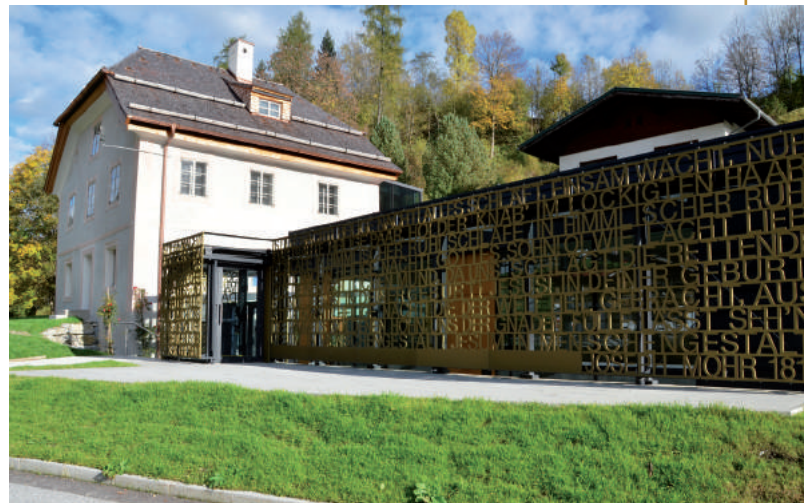
The Pflegerschlossl is an architectural jewel in baroque style and was sensitively restored with a barrier-free design.