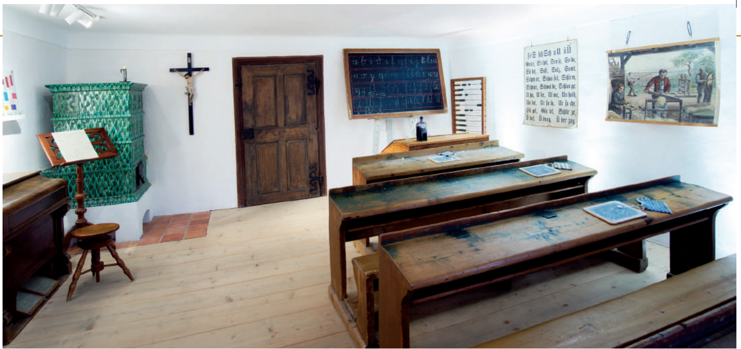
Silent Night Museum Arnsdorf

burg started an almost parallel process to that of Austrian reform. David Neukomm (1745-1805), father of the composer Sigismund Neukomm (1778-1858), was the first teacher in the city of Salzburg who taught according to the so-called "Normal Methods" learned in Vienna. He subsequently trained numerous other teachers and took over the Trivialschule (trivium school) in the Kaiviertel region in 1776. As early as 1777, a "Public German Secondary School" was opened and in 1790 a teacher's seminar was set up under the direction of the writer and pedagogue Franz Michael Vierthaler (1758-1827). Vierthaler published numerous influential textbooks that were also used in Bavaria. The autonomy of the Salzburg school administration was probably the reason why Franz Xaver Gruber had to be re-examined in Salzburg in 1807 before he could take up his apprenticeship in Arnsdorf, despite having successfully passed his teacher's examination in 1807.