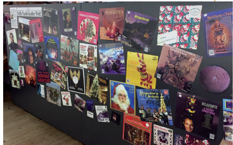
The large collection of Silent Night records in the Museum at Widumspfiste.

“Silent Night and the Sound of the Alps” in Fügen Castle Fügen’s Baroque Castle with its excellent location in the centre of Fügen and the Silent Night memorials provide the perfect setting to retrace the musical message of peace in Silent Night with a large exhibition in the commemorative year. The centre-piece is the distribution of the song all over the world. Over four levels of the castle, the history of Silent Night and the development of tourism in the Zillertal valley will be presented to show