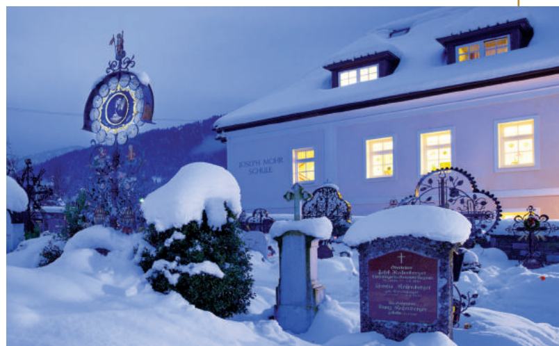
The grave of Joseph Mohr, behind the school named after him.