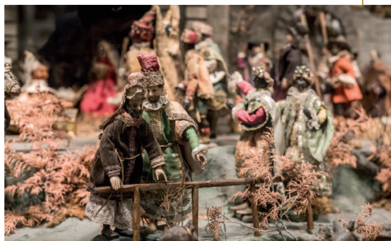
Close-up of the Oberndorf Silent Night nativity scene in the Innviertler Volkskundehaus, Ried im Innkreis.

The nativity scene will be restored in 2018 and displayed in a new format on 22 November 2018.