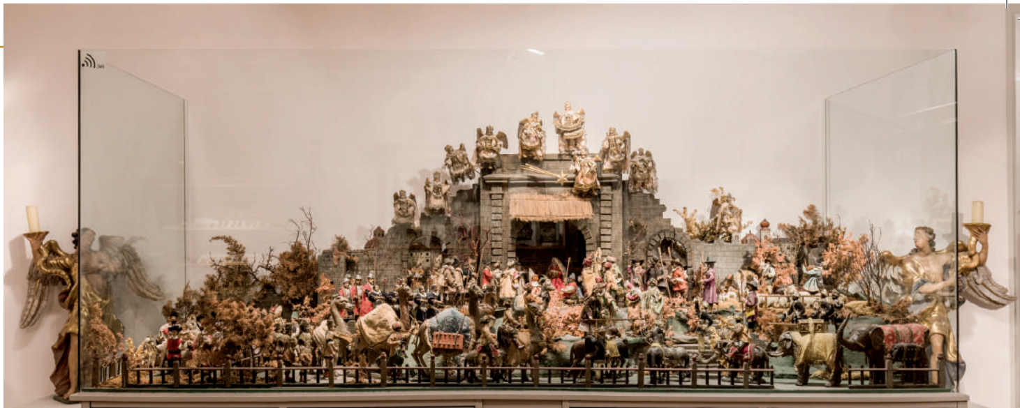
The Oberndorf Silent Night Nativity Scene in the Innviertler Volkskundehaus, Ried im Innkreis (Innviertler Volkskundehaus)

and the story of its acquisition, he wrote: "It is the nativity scene, in front of which the Christmas carol of all Christmas carols, 'Silent Night' was performed for the first time in 1818. Could it not be called the "nativity scene of all nativity scenes?" 3