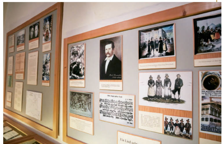
Documents relating to the history of the song in Museum Mariapfarr.