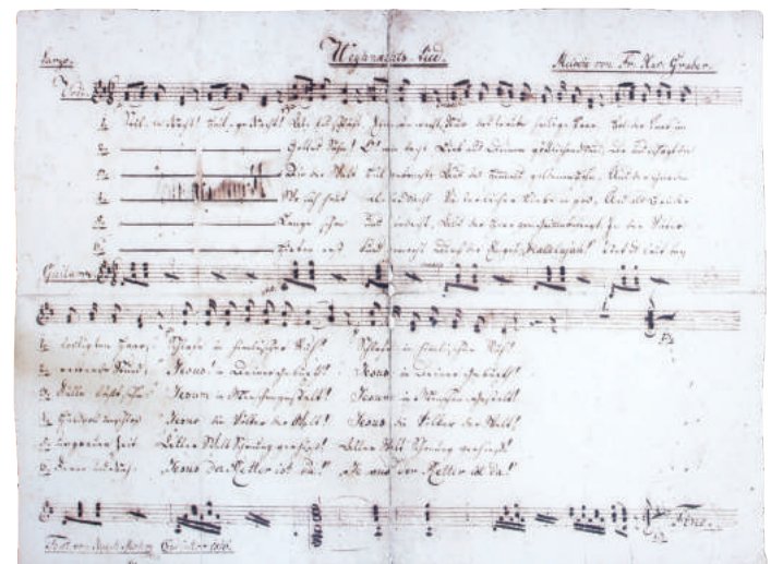
The Silent Night Autograph by Joseph Mohr.