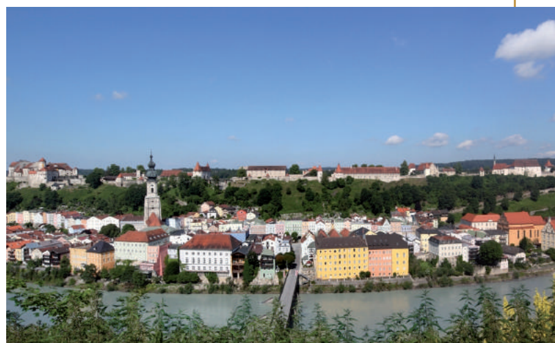
View from Ach over the Salzach River.

position should be a piece for organ solo relating to the theme of Silent Night by Franz Xaver Gruber and Joseph Mohr with a maximum duration of 10 minutes. It should be equally suitable for concert and liturgical practice but in free form.