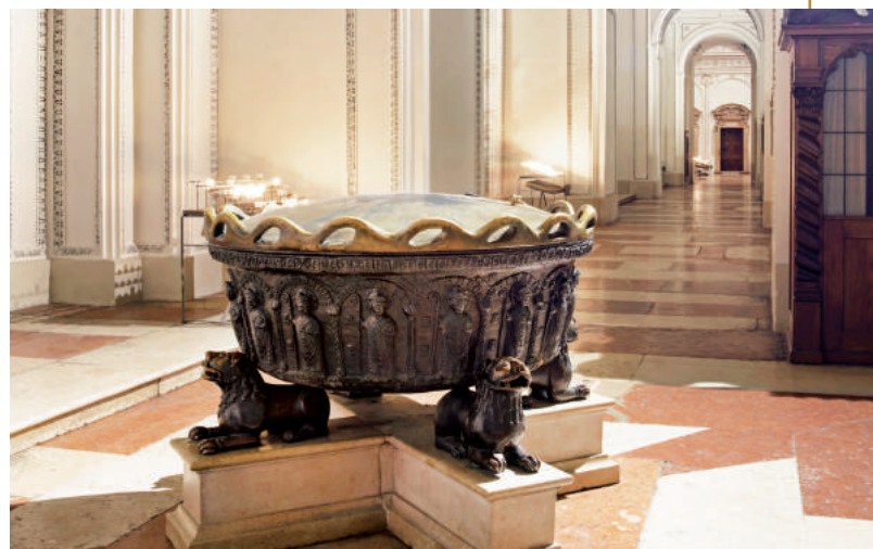
Joseph Mohr was baptised on 11 December 1792 in the baptismal font in the Salzburg Cathedral.

For the last decade, the University Theatre located in the old auditorium is used as a venue for music and music theatre performances. University students, high school students and members of the renowned Salzburg music institutions participated in the performances at the end of each academic year. Young talents were allowed to test their potential. These performances were intended as public final examinations for the students of all faculties who attended rhetoric seminars. Wolfgang Amadeus Mozart's opera "Apollo and Hyacinth", which Mozart composed when he was just 11 years old, was performed here as an intermission filler between the acts of ancient