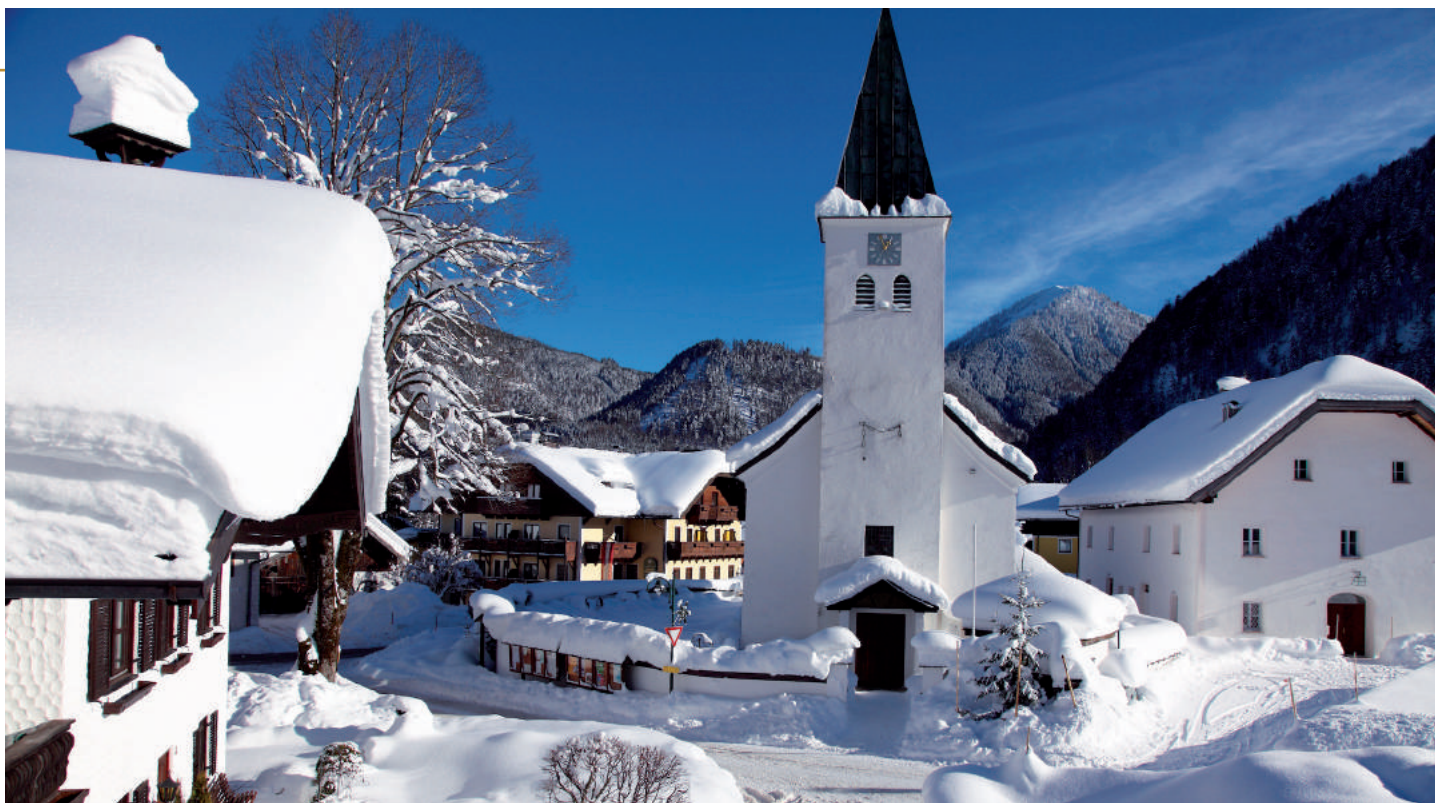
Town view of Hintersee

pies of manuscript records by Joseph Mohr are on display: an excerpt from the 1828 baptismal record and the annual report of the Hintersee pastoral care for the years 1829/30.