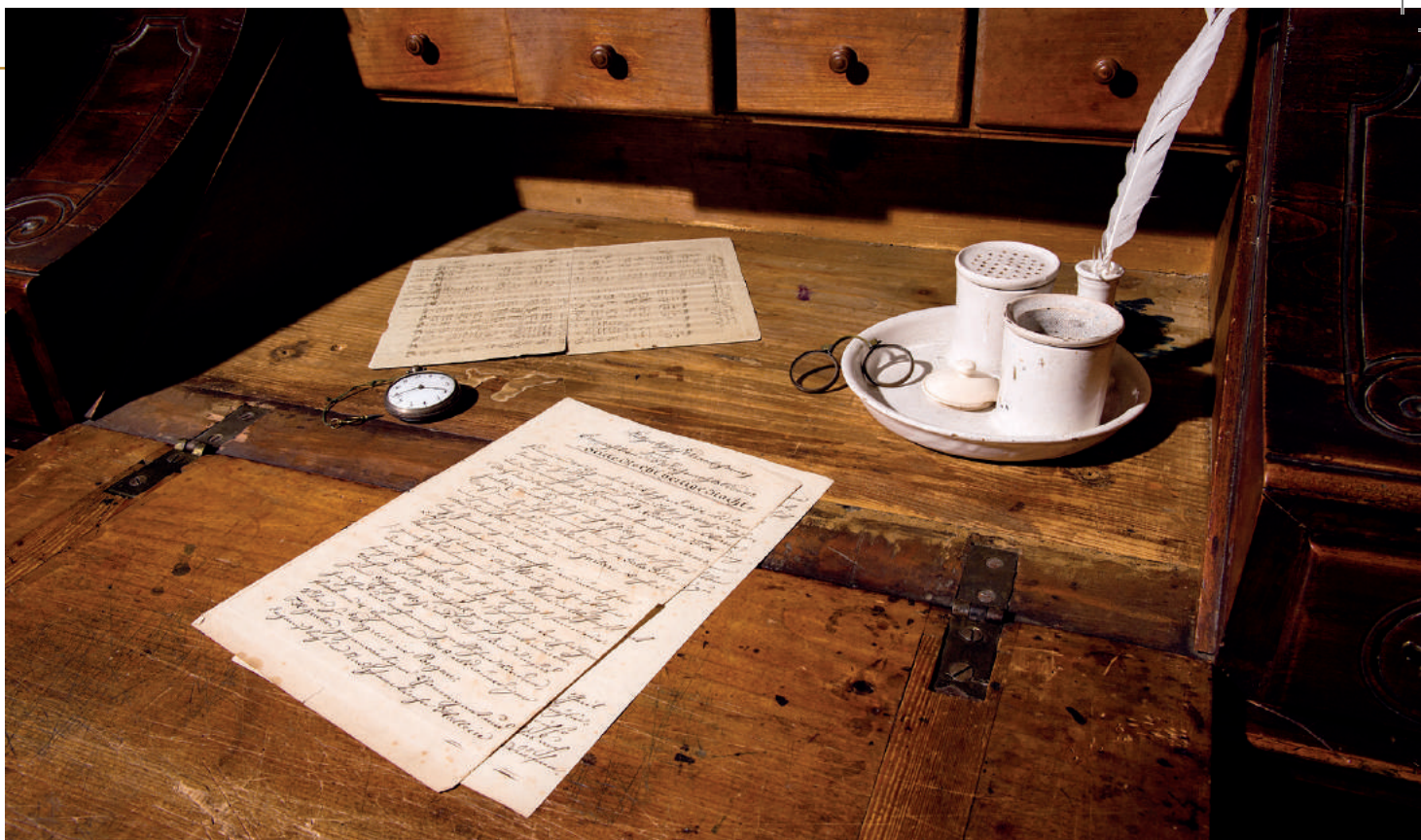
Items relating to the history of the song: in front the "Authentic Account", behind Autograph V by Franz Xaver Gruber.