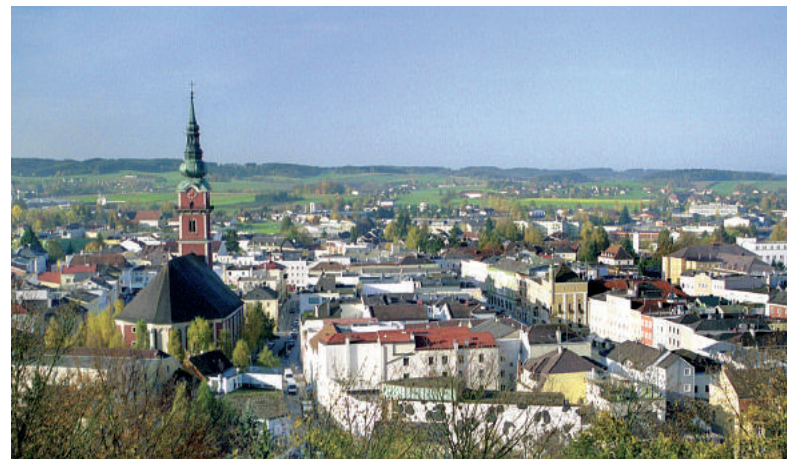
The town Ried im Innkreis.